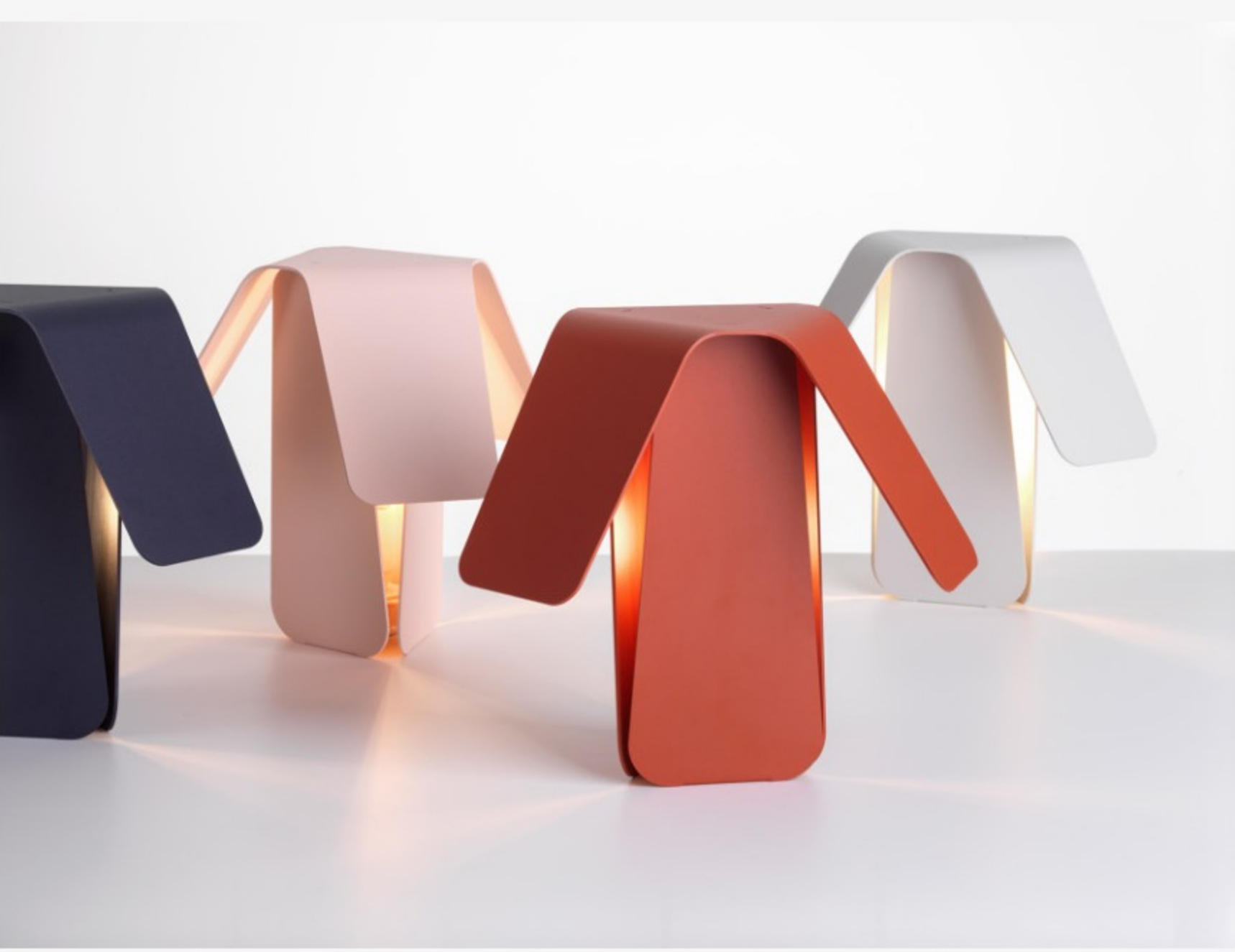
With Schätti Leuchten, the formal linearity of sheet steel becomes the stuff of elegantly reduced lighting pieces. Shown here, Andar wall light (top) and Dri table lamp (above)

Take their ongoing lighting brand Schätti Leuchten – developed from a collaboration with award-winning Zurich-based product designer Jörg Boner. Launched in 2012 and positioned squarely in the workspace and architectural-lighting markets, the brand has transformed the formal linearity of sheet steel, with its relative thinness, into a considered and consistent design language for an LED-powered lighting collection – one characterised by reduction, line and a visual lightness.