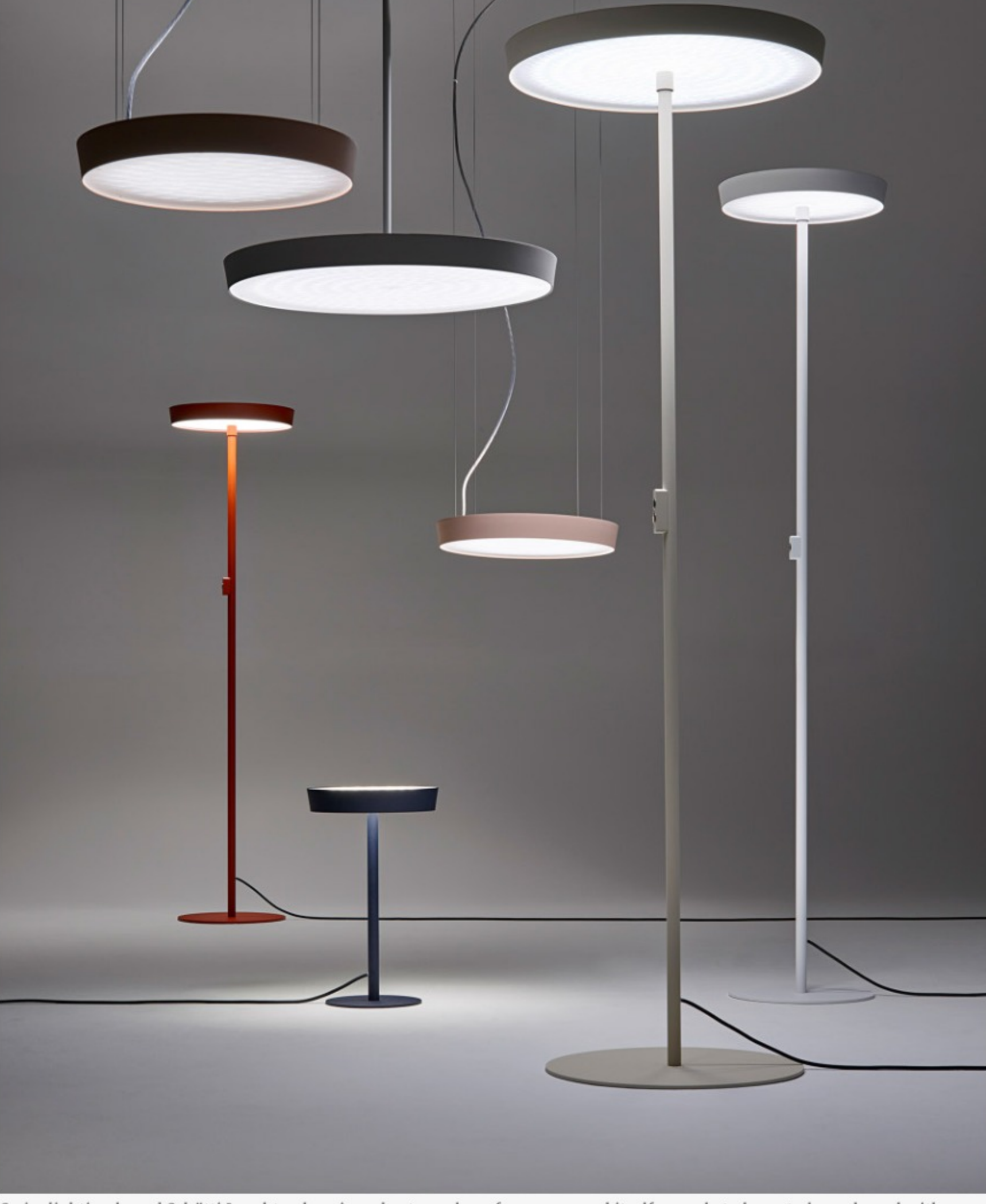
Swiss lighting brand Schätti Leuchten has, in a short number of years, proved itself a market player to be reckoned with, specialising as it does in supremely considered luminaires for the office and architectural-lighting segments

If light is one of the fundamental elements of architecture, then Swiss lighting brand Schätti is laying the foundation.