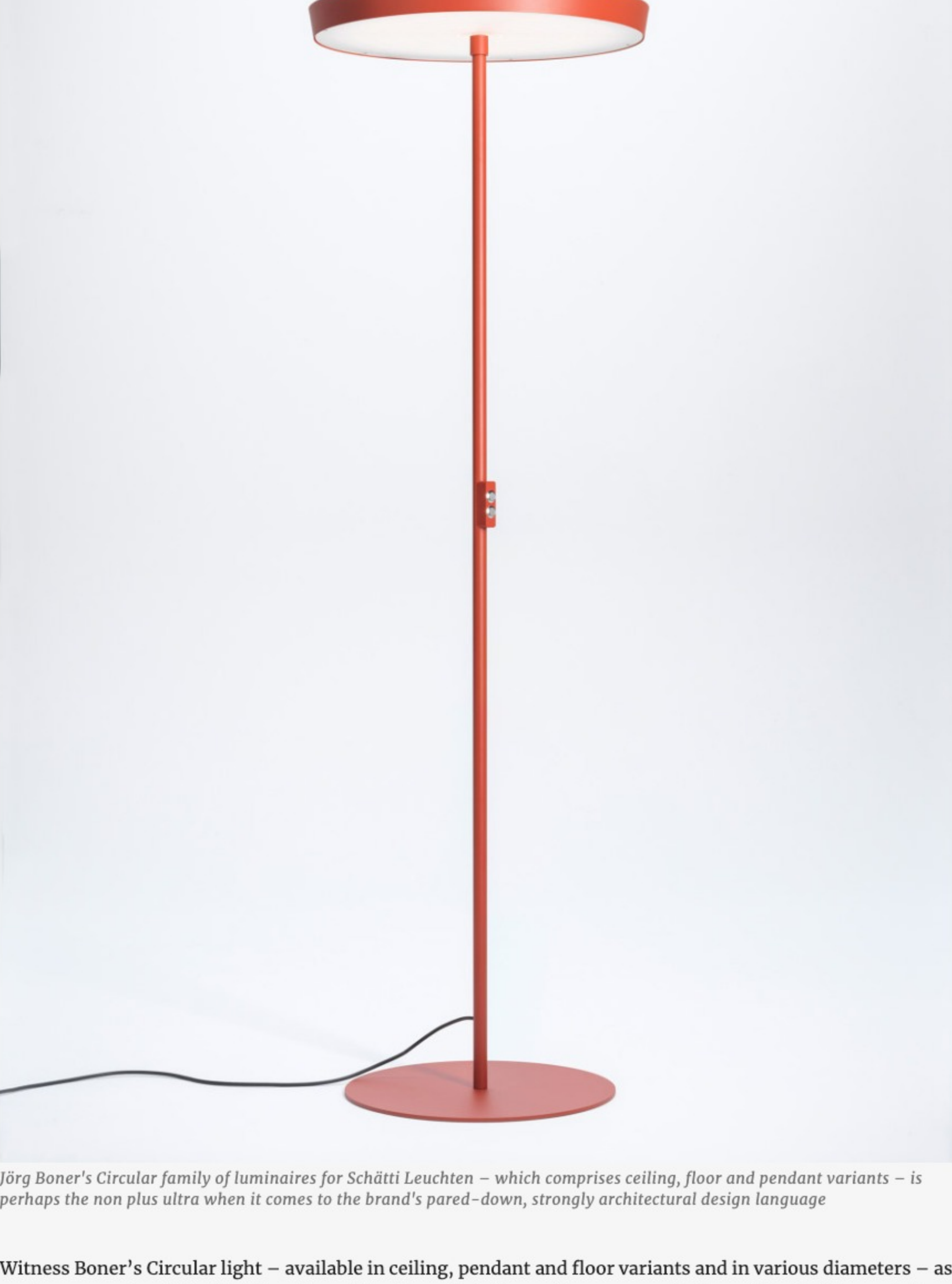
Jörg Boner's Circular family of luminaires for Schätti Leuchten – which comprises ceiling, floor and pendant variants – is perhaps the non plus ultra when it comes to the brand's pared-down, strongly architectural design language

Witness Boner's Circular light – available in ceiling, pendant and floor variants and in various diameters – as a prime example of this thinking. Geometrically perfect, the continuous, precise line of its slightly conical, metal band delineates the field in which the light source sits. On a functional level as a luminaire, the piece serves to support and enhance architecture, while at the same time being a piece of micro-architecture itself.