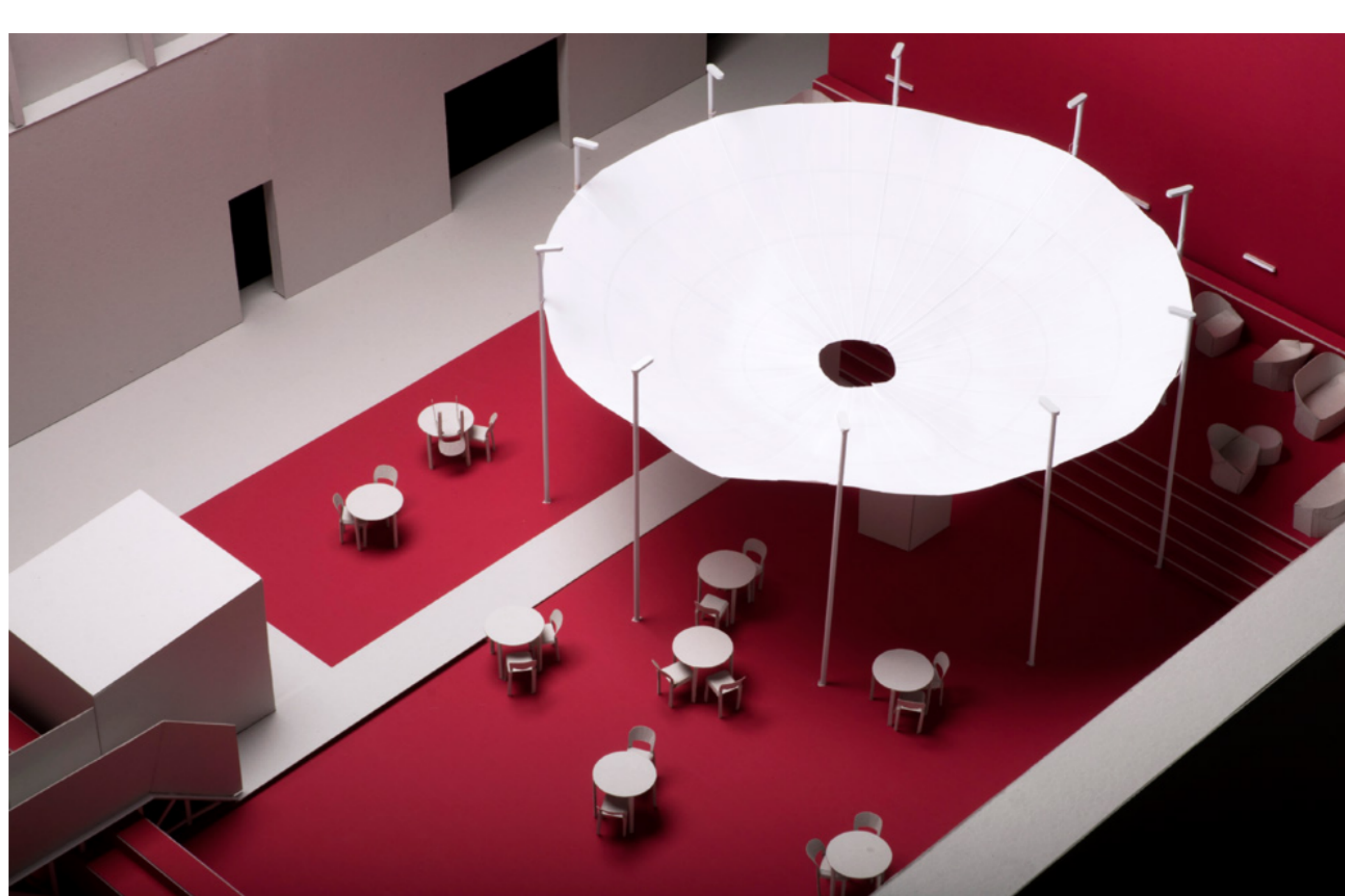
A path runs through the longitudinal space leads up stairs that link the "Design Plus" exhibition with the Café and the Lounge.