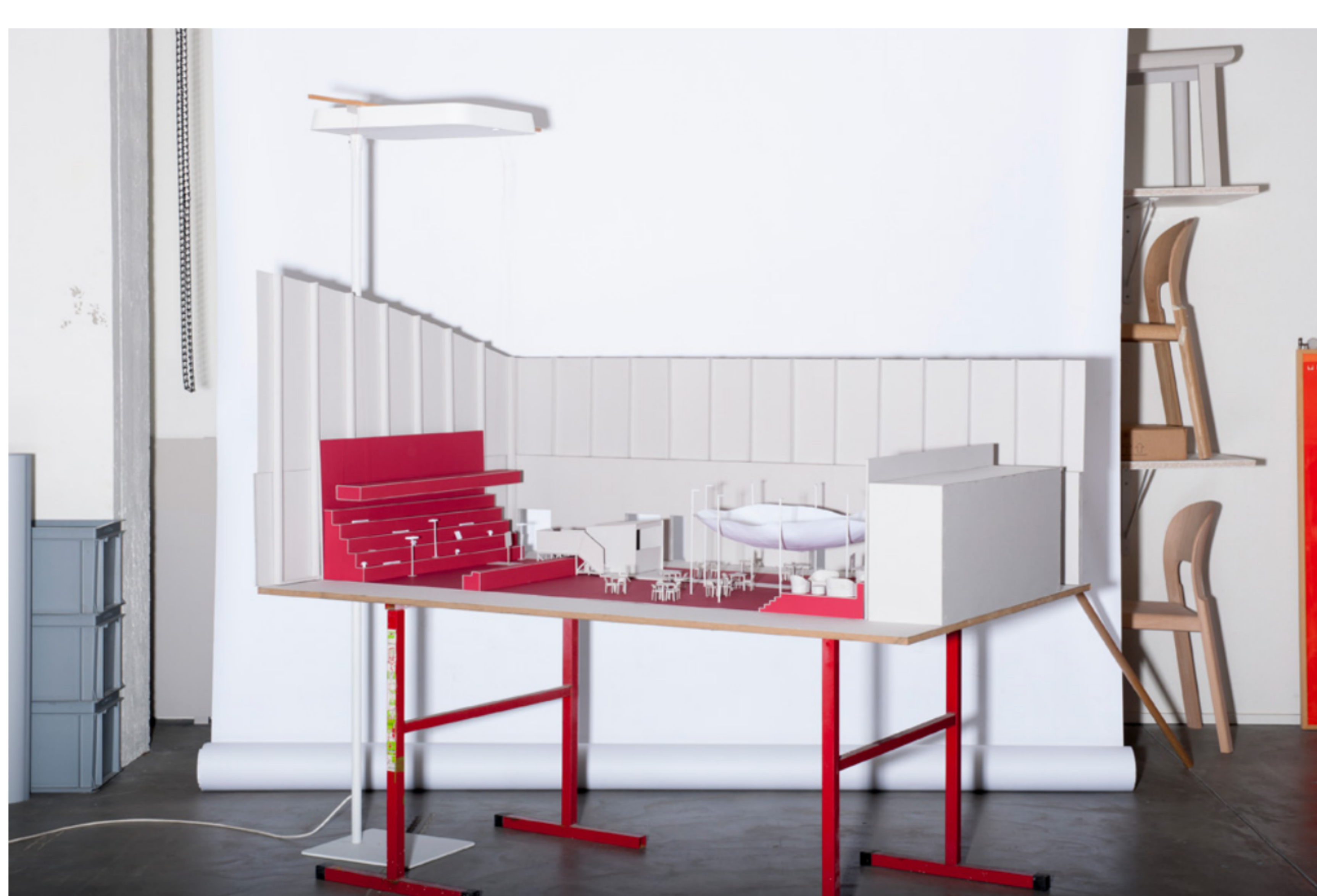
Model in the studio of Jörg Boner: The exhibition for the "Design Plus" competition, the "Stylepark Café" and the "Stylepark Architects' Lounge" are placed on 420 square meters.

The circle of light that is outlined on the floor creates a transition between the Café and the Lounge, which boasts the comfy leather "Oyster" armchairs and sofas Jörg Boner designed for Wittmann. Secluded from the hustle-and-bustle, visitors to the Lounge can simply enjoy the company of others and watch goings-on in the Café. Hard to imagine a more comfortable retreat for discussions with other trade experts.