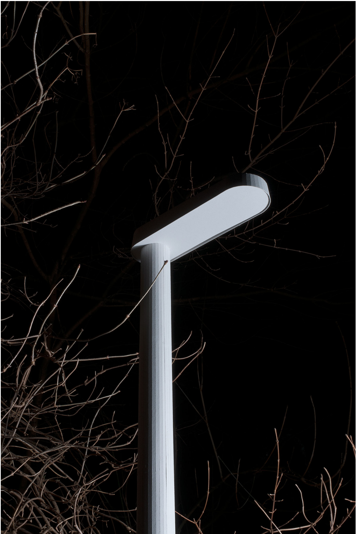
08 Cardboard model 1:1 scale